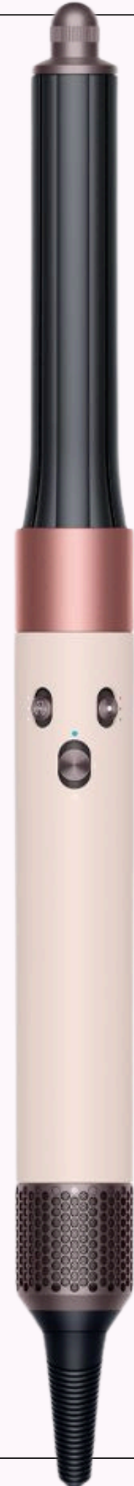
Dyson Airwrap I.D Multi-Styler & Dryer Straight + Wavy Hair $649.99

What we're really bringing back into 2026 is our hair care routine. I feel the most beautiful after having freshly washed and styled hair. Hair health and treatment is important but figuring out what works for your hair can be financially and time exhausting. However it's worth the time and effort. Here are some tips and products we've used in 2025 that are going to stick around in 2026.