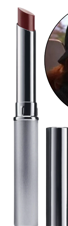
Clinique Almost Lipstick Buildable and flatters natural lip color. $25