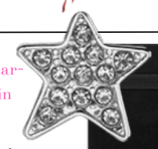
Charm Star-Crystal Pin $14

Journaling About absolutely anything and everything.