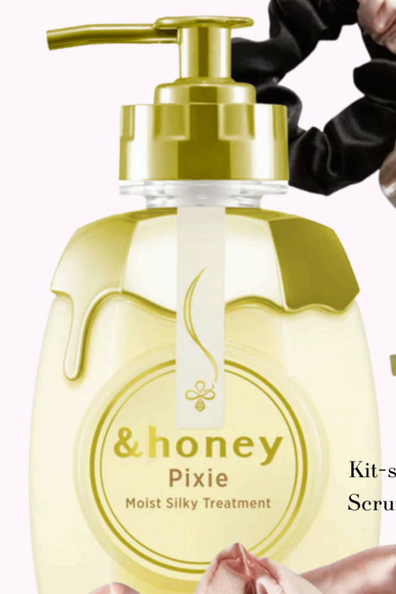
&Honey Moist Silky Treatment Moisterizes and detagles hair. $24.99

Step One Hair wash day. Washing hair with luke warm closer to the cooler setting. Quality of water can contribute to hair health. Such water can strip the natural oils that we produce to benefit our hair. Choose a treatment that can provide that moisture back.