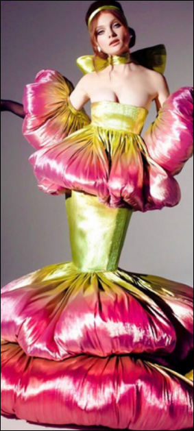
THE GARDEN OF TIME

The official dress code for the 2024 Met Gala is inspired by J.G. Ballard's 1962 short story "The Garden of Time." Designers and attendees will interpret this concept through their own lenses. However, it is expected that many looks that grace the carpet will incorporate a floral and botanical aura.